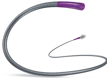
Direxion™ Torqueable Microcatheters