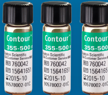
3 mL – Contour PVA Particles