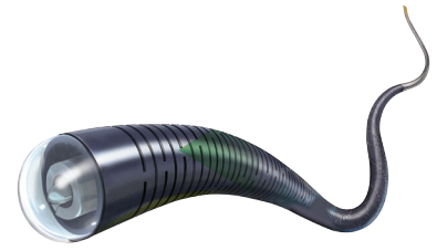
Fathom™ Steerable Guidewire